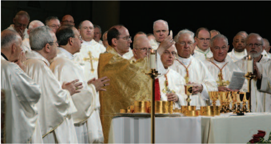
Bishop Thomas J. Olmsted of Phoenix elevates the Eucharist at the Opening Mass of the 127th Supreme Convention Aug. 4, as seven cardinals and numerous bishops concelebrate.