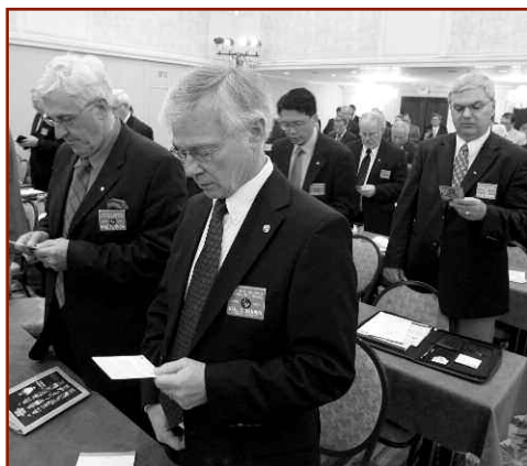
State deputies recite together the "Prayer for Priests" printed on a new K of C prayer card created for the Year for Priests, which began June 19 (see sidebar below).

He added that he was encouraged at last year's Supreme Convention when delegates voted unanimously to establish the Culture of Life Fund. The Order's subsequent sponsorship of ultrasound machines at pregnancy resource centers is a tangible example of how Knights can transform the culture.