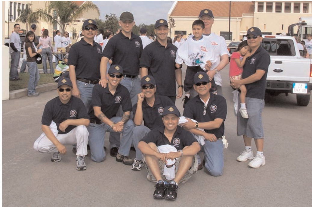
Members of Padre Pio Council 14293 at Naval Air Station Sigonella in Sicily, Italy, rest after a long day of environmentalism. Members and their families aided local volunteers who cleaned litter and trash from the streets of Motta Saint Anastasia.