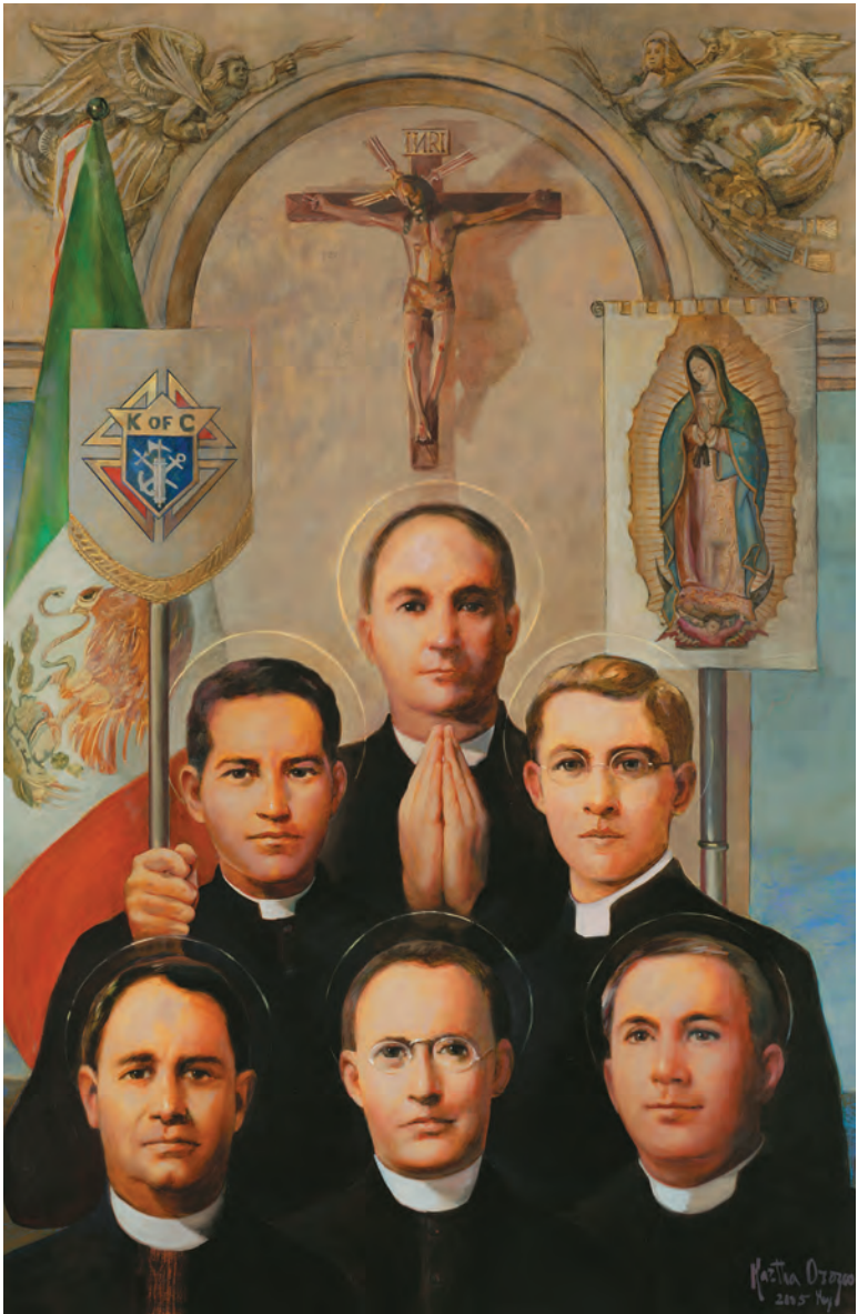
Knights of Columbus Martyrs of Mexico