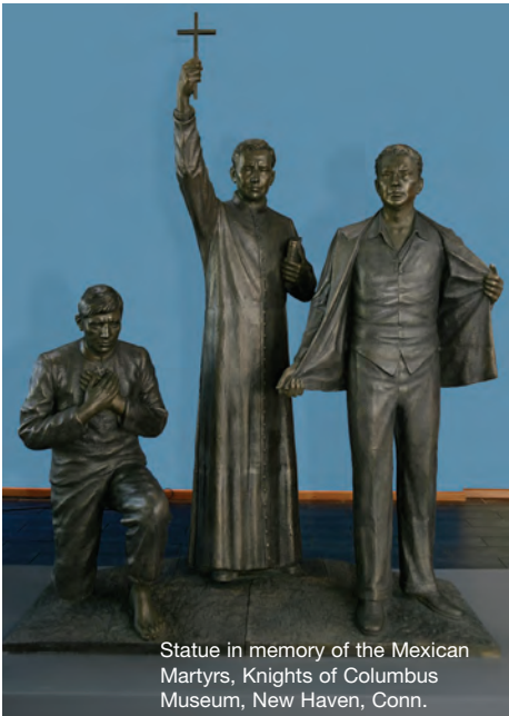
Statue in memory of the Mexican Martyrs, Knights of Columbus Museum, New Haven, Conn.

For three years (1926-1929), the Mexican people lived through violent persecution, in which priests and laypeople were ordered to renounce Christ in public. To refuse to do so meant facing not only punishment, but even torture and death. Thousands of Mexican Catholics gave witness to their faith or fought to defend it. In many cases, they paid for it with their lives. Their acts of love and bravery have echoed throughout the decades, and we remember their testimony today.