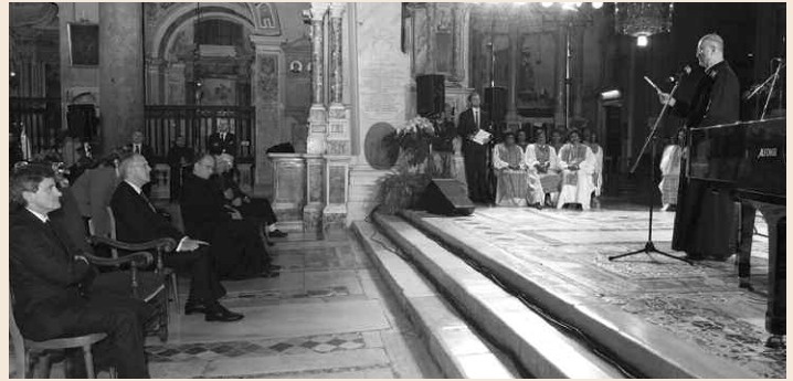
Supreme Knight Carl Anderson and Rome's Mayor Giovanni Alemanno listen to Cardinal Bertone's words of appreciation regarding the charitable efforts of the Knights of Columbus in Rome.

The concert was held in the Church of Santa Maria in Aracoeli adjacent to the Campidoglio, and featured the Gospel Choir of St. Thomas More Church in Washington, D.C., in honor of the groundbreaking. The square was dedicated to the Knights of Columbus in recognition of its charitable works on behalf of the people of Rome.