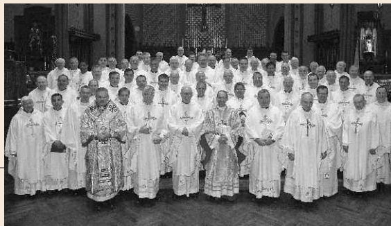
The first meeting of state chaplains is held in New Haven , and is attended by chaplains (including five bishops) from 58 jurisdictions.

Supreme Knight Carl Anderson addressed the Legatus 2011 Annual Summit, Feb. 3-5 , on the need to demonstrate an authentic witness to what it means to be a follower of Christ.