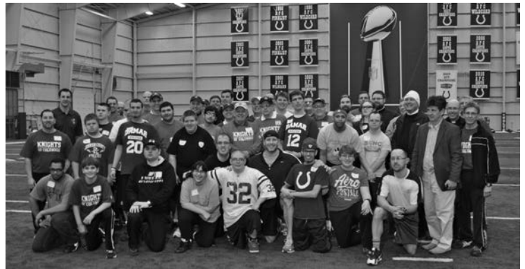
Participants and volunteers for the combine pose together.