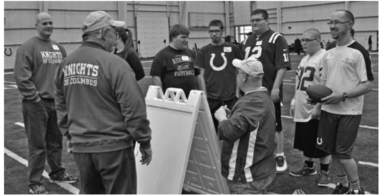
Special Olympics athletes listen to a briefing on a drill.