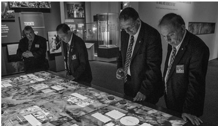
State deputies tour the multimedia displays at an exhibit at the Saint John Paul II National Shrine.