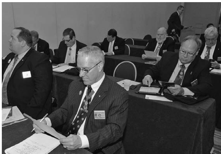
Meeting participants attend a workshop on Star Councils.

as the tools available to them for promoting membership growth in their jurisdictions.