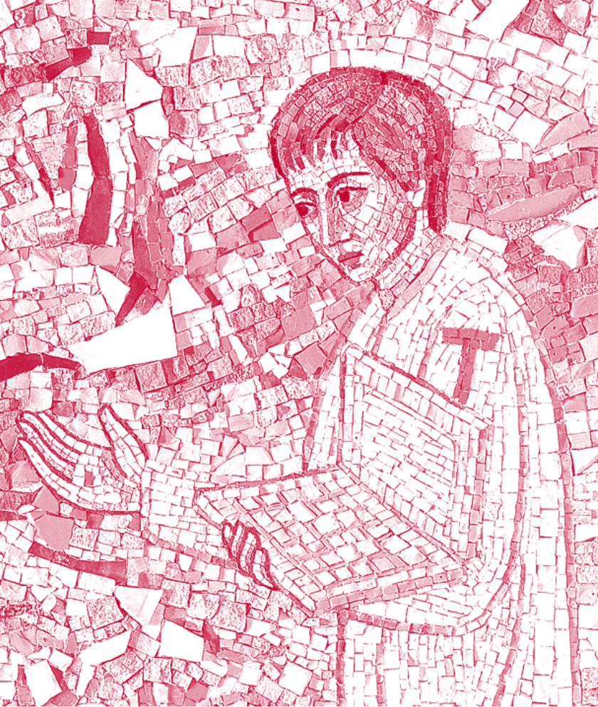
Detail from the Wall of the Parousia , Redemptoris Mater Chapel, Vatican City.