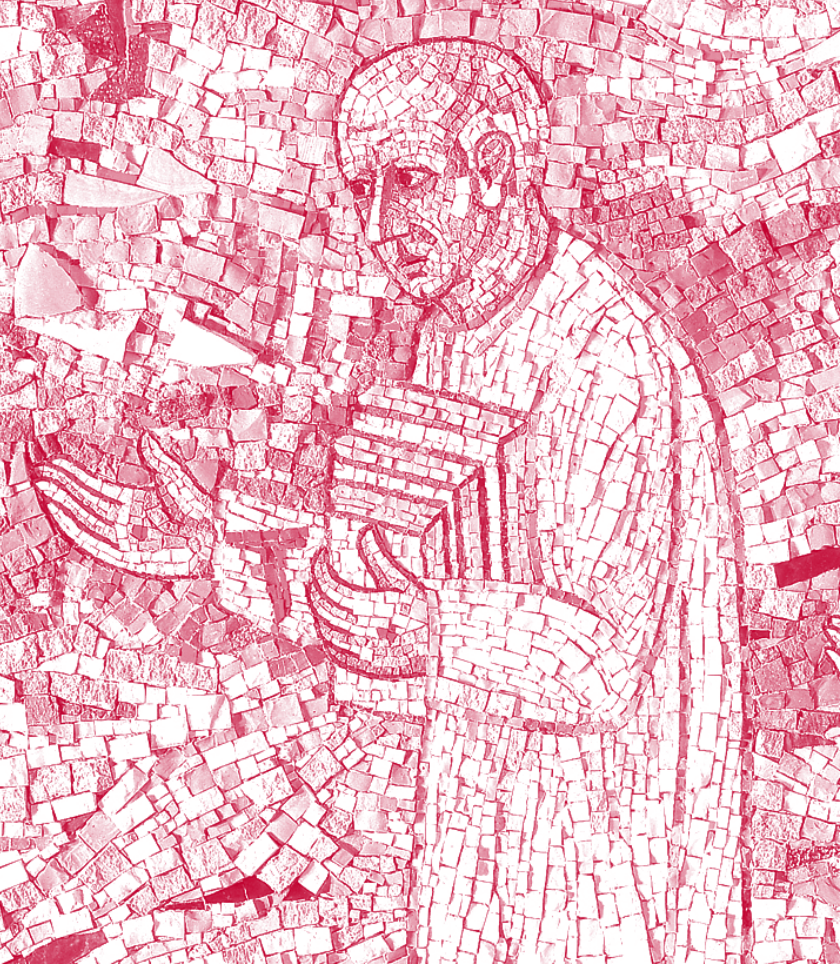
Detail from the Wall of the Parousia , Redemptoris Mater Chapel, Vatican City.