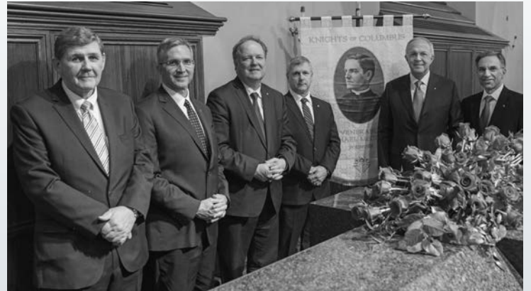
Following Mass, the supreme officers prayed before Father McGivney's sarcophagus, located in St. Mary's Church.