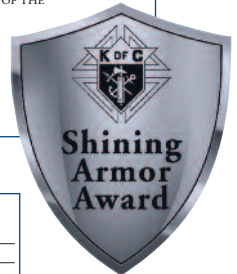
Lapel Pin (#1700)